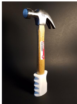
Figure 3. Example of household item, hammer ergonomic grip.

For household parts like the hammer ergonomic grip, thinner shells and less infill gave parts a soft and comfortable feel. Shown in Figure 3, the overhangs in the finger grips printed perfectly. This is an example of a large part with large layers (0.4 mm) to reduce printing time. Even with the visible layers, the part appears aesthetically acceptable.