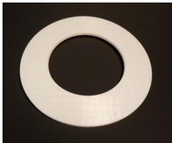
Figure 2. Example of flexible 3-D printed automotive related part, 2" gasket—shown enlarged for clarity.

The results of the 3-D prints with flexible filament were tolerable with a standard successful print for each print job as judged by function. Cura Lulzbot edition has predefined settings for NinjaFlex and these presets were used in order to represent the mostly likely printing settings by inexperienced consumers. The use of presets makes it straight forward for beginners to get started printing flexible objects. With the “quick print” settings enabled, users select the quality to be either high detail, normal or high speed. These selections mostly effect layer height and was altered on larger items like the hammer ergonomic grip, which was made with large layers to reduce printing time. The printing parameters that had a large effect on the end part was shell thickness and infill percentage. For the automotive related parts like the O-rings, gaskets and belts, the parts were printed with thick shells (1.2 mm) and low infill (20%). This provided an overall strong part with more flexibility. Shown in Figure 2, as a representative print, the average visual quality of the part was excellent.