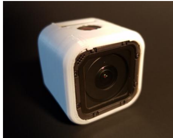
Figure 4. Example of product accessory, GoPro Session Camera Case.

of the detail users can still maintain, which is similar to harder thermoplastics when printing with flexible filament.