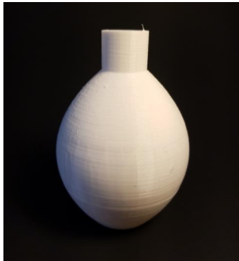
Figure 5. Example of medical device component: newborn medical ventilator bag.

Finally, the medical device in Figure 5 was printed at 50% infill with thinner shells because it needed to be robust and strong, but still flexible and light. This is another large print that was printed at a slightly lower layer height (0.25 mm). The print worked well and had only a light amount of stringing on the inside of the part itself that did not interfere with the functioning of the component nor impact in aesthetically.